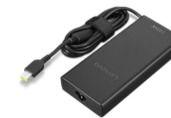
Lenovo 245W AC Adapter (Slim tip)-EU