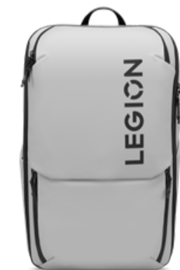
Lenovo Legion 17" Gaming Backpack GB800 (Light Gray)