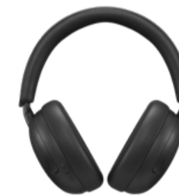
Lenovo Wireless Headphone 2000