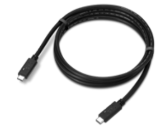
Lenovo USB 20Gbps USB-C to USB-C Cable 1.5m