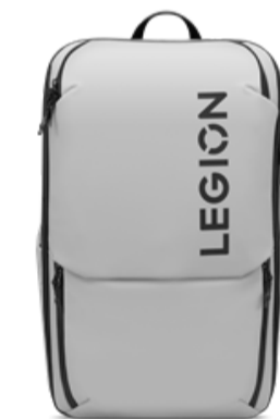
Lenovo Legion 17" Gaming Backpack GB800 (Light Gray)