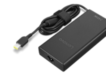
Lenovo 245W AC Adapter (Slim tip)-EU